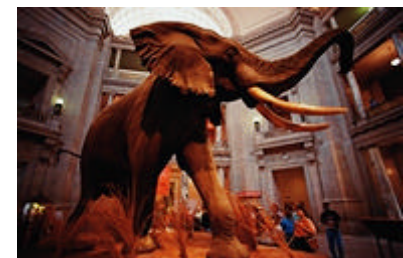
Smithsonian Museum of Natural History