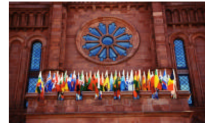
Flags on Smithsonian Castle