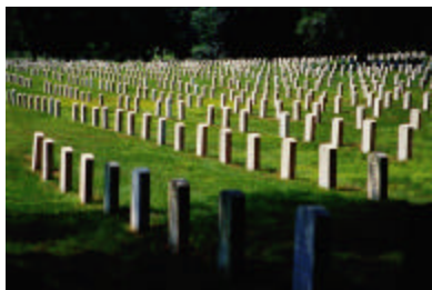
Arlington National Cemetery