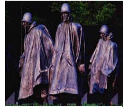
Korean War Memorial

Exceed your Expectations! Success is Knocking on your Door!