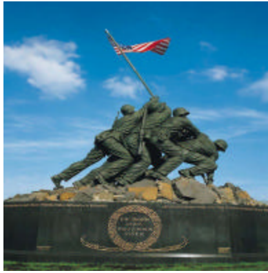
Iwo Jima Memorial