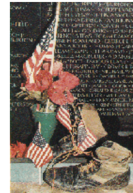
Vietnam War Memorial